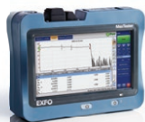
MaxTester 700B OTDR Series