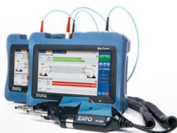
MaxTester 940 Fiber Certifier OLTS