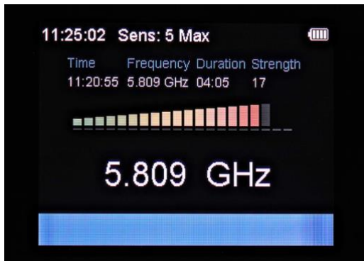
Live Main Screen detecting signal