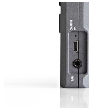
Charge Socket & Earphone Socket