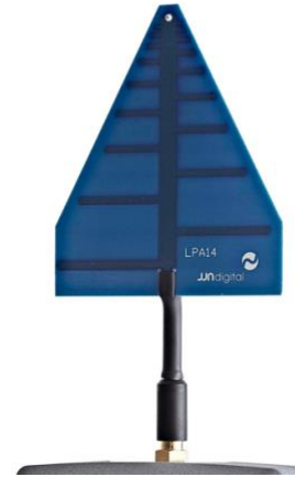
Directional High Frequency Antenna