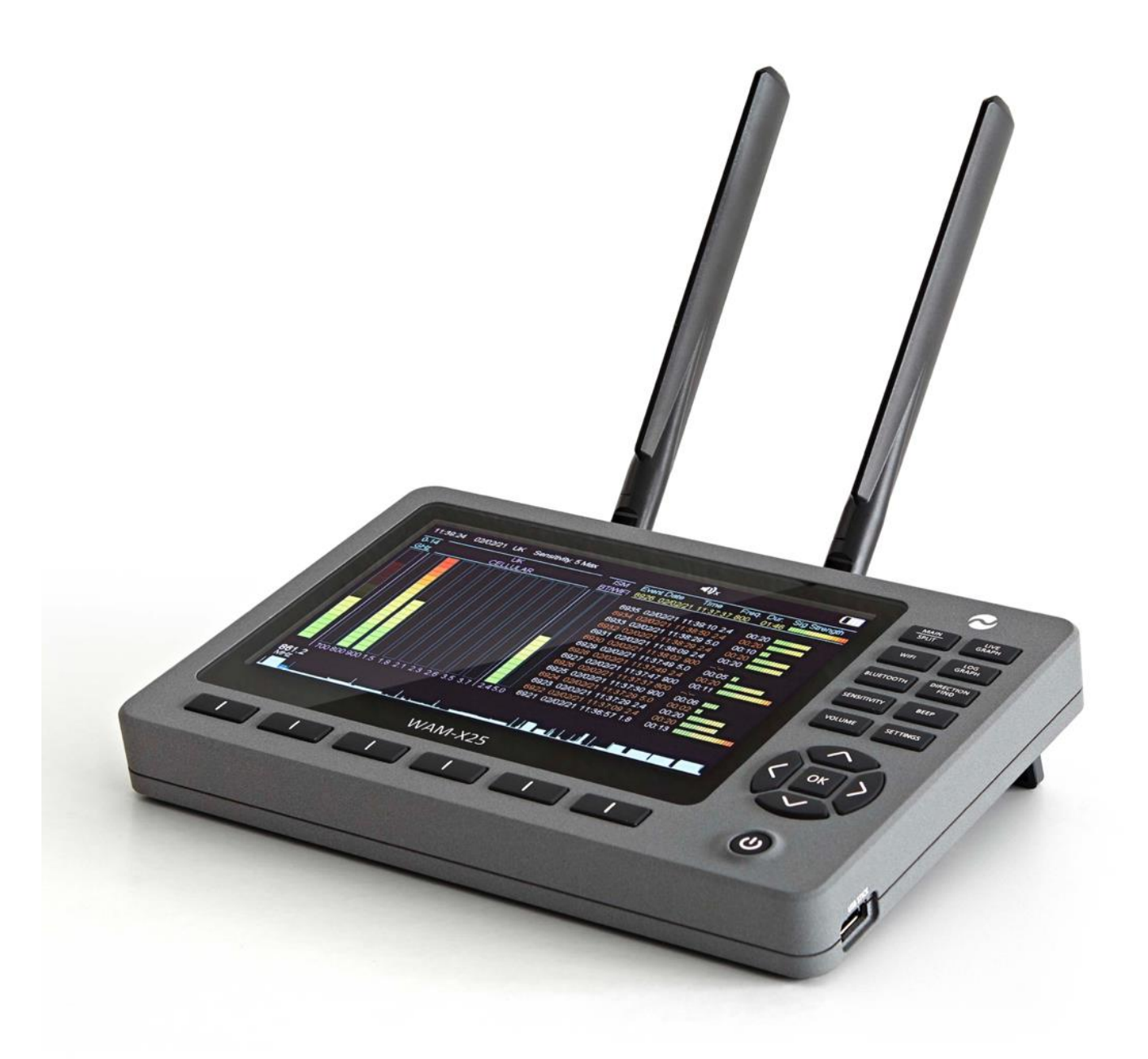
Cellular 2G/3G/4G/5G - 2.4GHz/5GHz Wi-Fi/Bluetooth Wideband 0-14 GHz - Wi-Fi Network & Bluetooth Analyser Direction Find Function