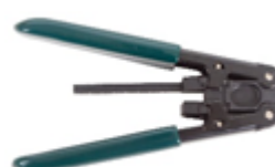
Drop Cable Stripper