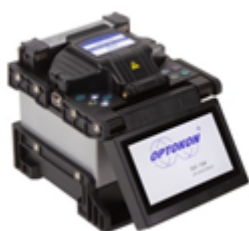
OSC-700 Fusion Splicer