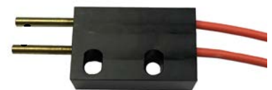
RAA-LT880 Transmissive Head